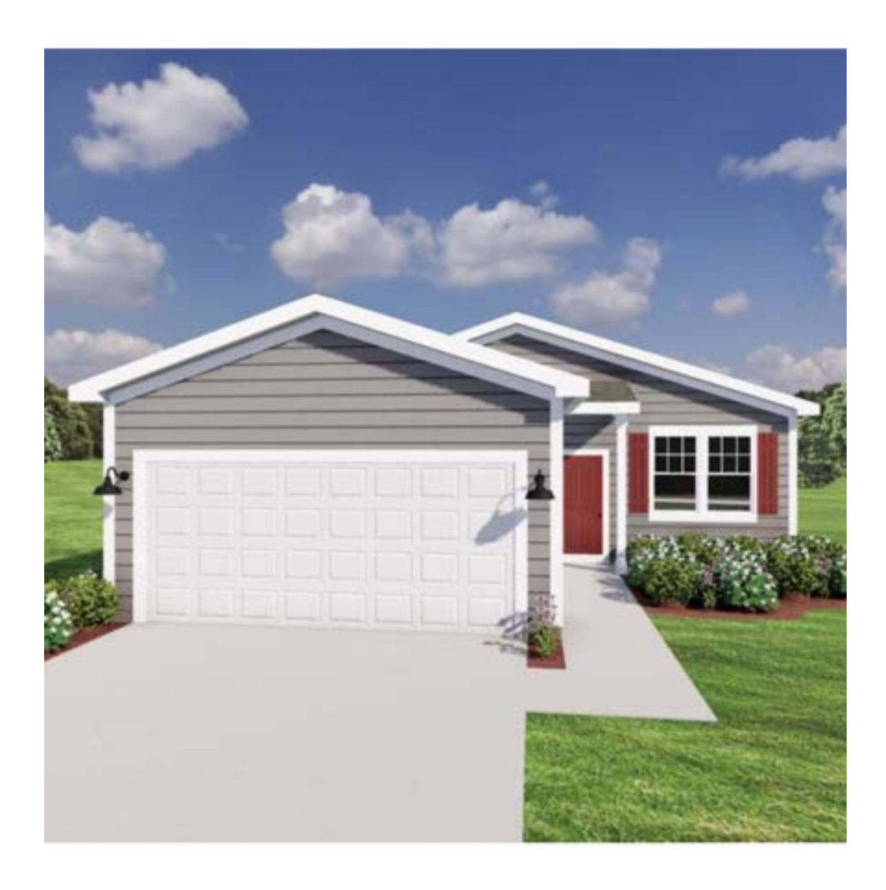
ASPEN - CRAFTSMAN