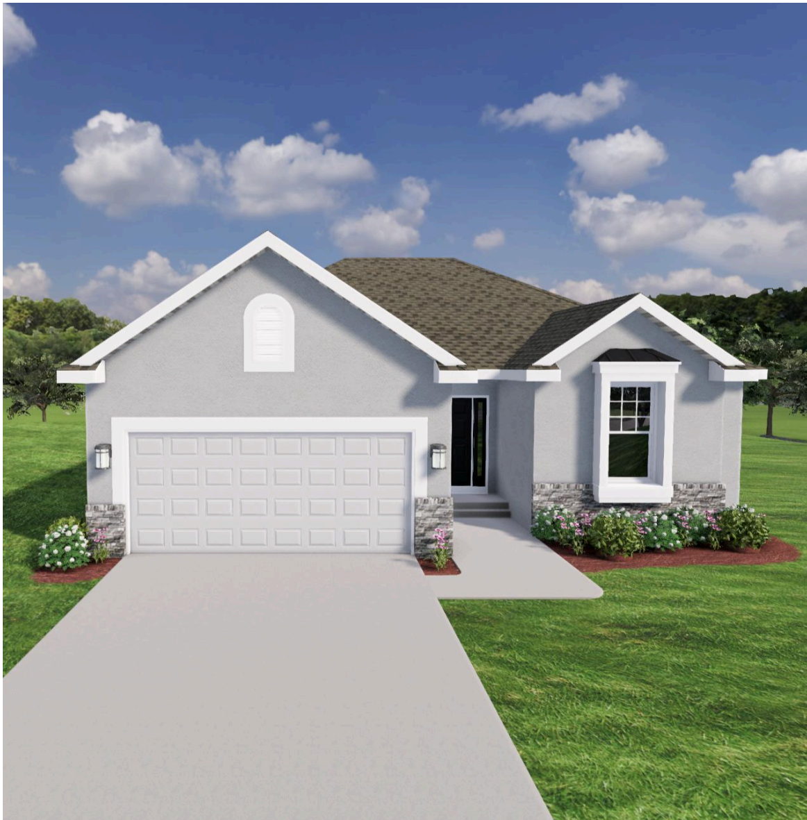
REDBUD - ELEVATION D