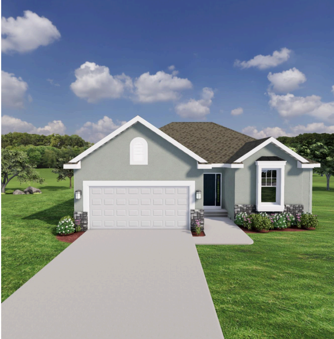
BIRCH - ELEVATION D